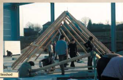
the building is quite finished

SCHOOL OF ARCHITECTURE PARIS-MALAQUAIS FRANCE SCHOOL OF ARCHITECTURE OF LYON