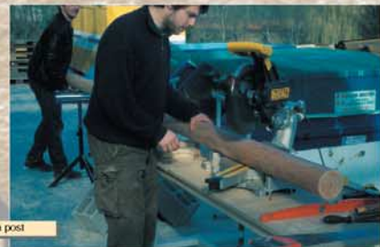
manufacture of a post