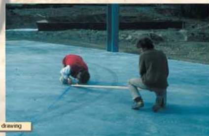
ground implantation drawing