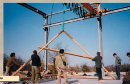
raising a frame